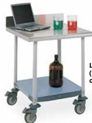
LTM30XS3 (Shown with casters)