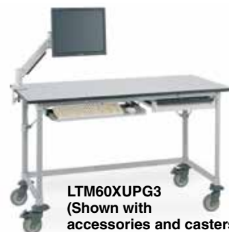
LTM60XUPG3 (Shown with accessories and casters)

Note: Lab Worktables are load rated at 50 lbs. (23kg) per square foot up to a maximum of 600 lbs. (273kg), assuming load evenly distributed. Worktables with Black Phenolic Top and 3-Sided Frame