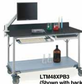
LTM48XPB3 (Shown with backplash accessory and casters)

Note: Lab Worktables are load rated at 50 lbs. (23kg) per square foot up to a maximum of 600 lbs. (273kg), assuming load evenly distributed.