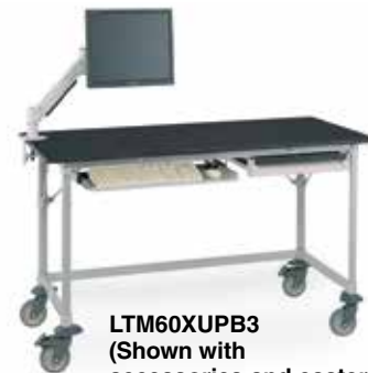
LTM60XUPB3 (Shown with accessories and casters)

Note: Lab Worktables are load rated at 50 lbs. (23kg) per square foot up to a maximum of 600 lbs. (273kg), assuming load evenly distributed. Worktables with Black Phenolic Top and 3-Sided Frame