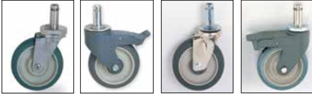
5MDXA 5PCBX 5MPX 5PCBXM