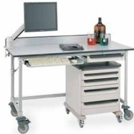
MetroMax i® Lab Worktable (Shown with accessories, casters and Starsys Cart)