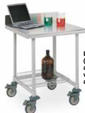
LTM30XUS3 (Shown with accessory wire shelf and casters)