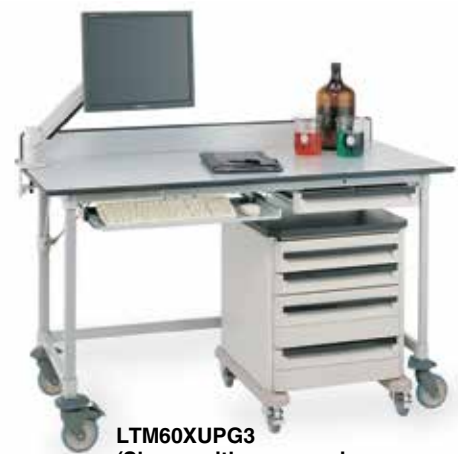
LTM60XUPG3 (Shown with accessories, casters and Starsys Cart)

Note: Lab Worktables are load rated at 50 lbs. (23kg) per square foot up to a maximum of 600 lbs. (273kg), assuming load evenly distributed.