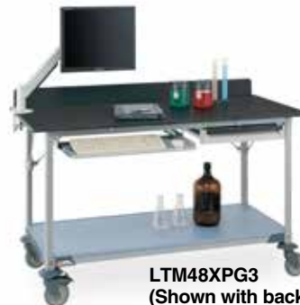
LTM48XPG3 (Shown with backplash accessories and casters)

Note: Lab Worktables are load rated at 50 lbs. (23kg) per square foot up to a maximum of 600 lbs. (273kg), assuming load evenly distributed. Worktables with Black Phenolic Top and 3-Sided Frame