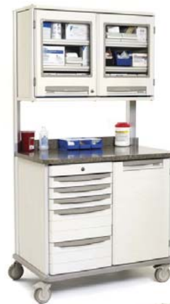
Double-wide Mobile WorkCenter with Laminate Countertop