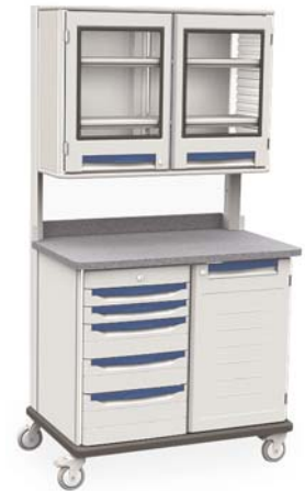
Model # SXRMENT2 with SXRDOH27P Overhead, (2) SXRDOHPS Shelves and Clear Locking Doors

* Triple-wide overhead cabinets are only offered as part of Mobile WorkCenter offering. Contact your Metro representative for more information.