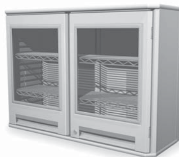
Double-wide Overhead Cabinet with Wire Shelves (2) and Locking, Clear Doors