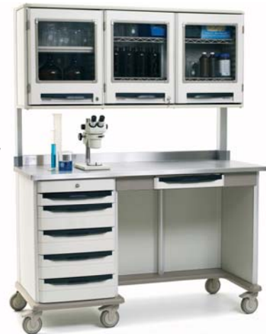
Triple-wide Mobile WorkCenter with Kneewell, Overhead Storage and Stainless Steel Top