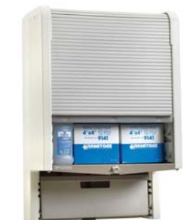
Tambour Door Overhead (Also available on Mobile WorkCenters)