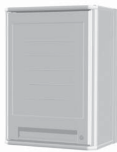
Single-wide Overhead Cabinet with Solid Door