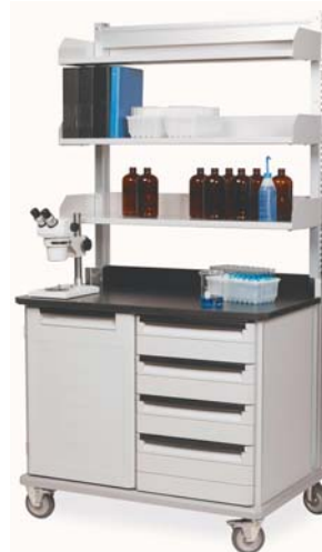
Mobile WorkCenter with Reagent Shelving

5" (127mm) Swivel/Lock (Directional) Casters (available by request) Other specialty caster options are available, consult your Metro representative.