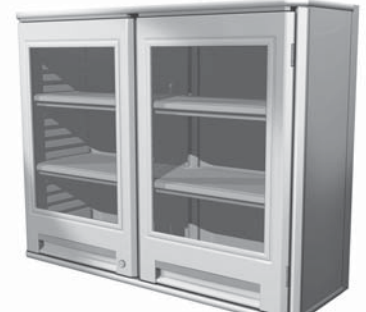
Double-wide Overhead Cabinet with Polymer Shelves and Locking, Clear Doors