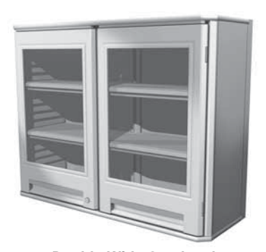
Double-Wide Overhead Cabinet with Polymer Shelves and Locking, Clear Doors