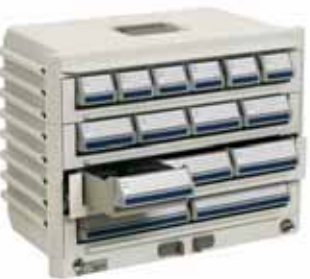
Single bin and Storage level access modes available.

Note: 2 drawer pulls are required for double-wide heavy-duty drawers. Note: Actual color images can be seen in the Commercial Solutions