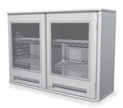
Double-Wide Overhead Cabinet with Wire Shelves (2) and Locking, Clear Doors