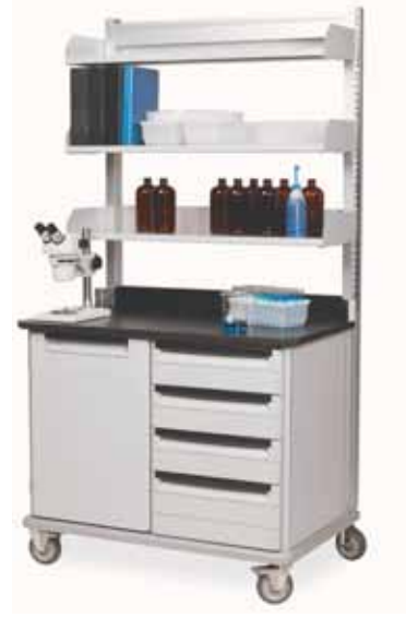
Mobile WorkCenter with Reagent Shelving

*Base unit working height is equal to Base interior height +9" [229mm] (based on 5" [127mm] casters)