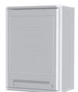
Single-Wide Overhead Cabinet with Solid Door