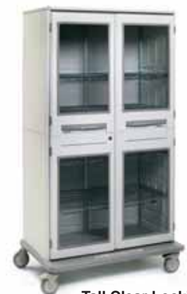
Tall Clear Locking Center- Closing Door Set for units with double-wide wire shelves