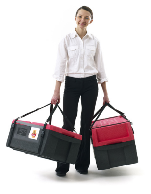
MLS1 Carrying Strap