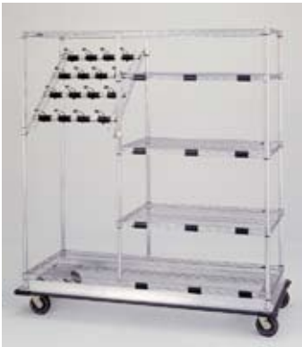
Model # CPC3/2LC – Standard Combination Style with 36" (910mm) bars and 24" (610mm) shelves