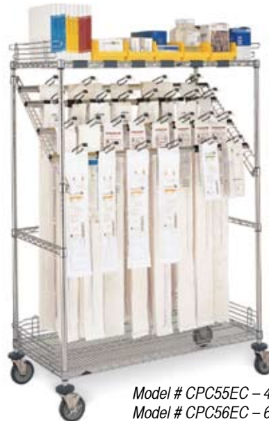
Model # CPC55EC – 48" (1219mm) bars shown Model # CPC56EC – 60" (1524mm) bars