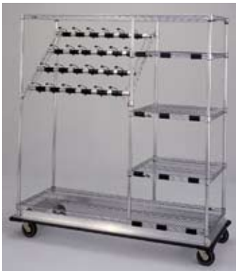
Model # CPC2/3LC – Standard Combination Style with 24" (610mm) bars and 36" (910mm) shelves