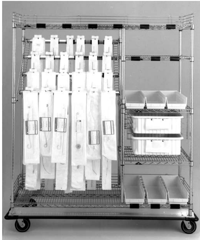
Deluxe Combination Style with 36" (910mm) bars and 24" (610mm) shelves. Model # CPCD3/2LC