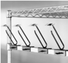
Close-up of Catheter Side Bar