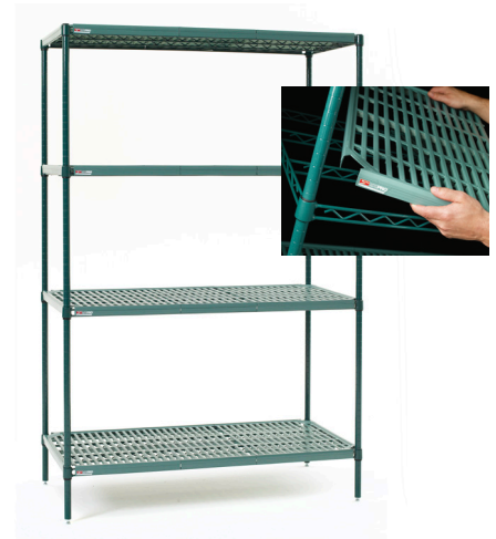
Four Shelf Starter Model

NOTE: Not suitable for cart wash applications.