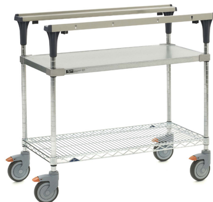
MS1836-FGBR: Solid Galvanized and Brite Wire Shelves