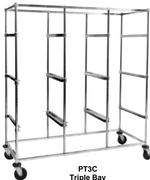
PT3C Triple Bay