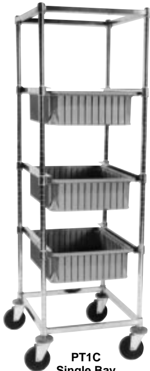
PT1C Single Bay (Totes Sold Separately)