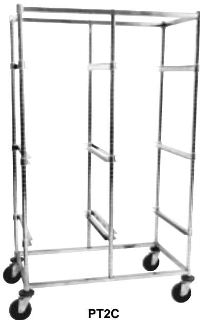
PT2C Double Bay