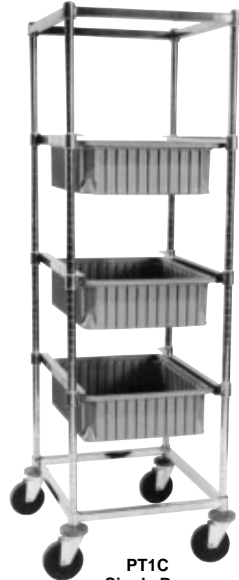
PT1C Single Bay (Totes Sold Separately)

Each carrier has two brake casters and two swivel casters. *Single-bay carriers are equipped with six S3C single slides (3 sets). **Double-bay carriers are equipped with six S3C single slides (3 sets) and three S4C double slides. ***Triple-bay carriers are equipped with six S3C single slides (3 sets) and six S4C double slides (3 sets). Also available without slides. Order with catalog numbers PTN1, PTN2, PTN3.