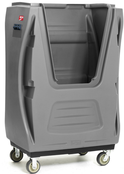
TX48A-BULKG Bulk truck, with no enclosures

All Metro Catalog Sheets are available on our website: metro.com