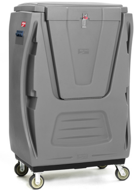
TX48A-BULKSECG Bulk truck, with enclosures

Gate and Lid: (option for bulk truck) Molded polymer construction with stainless steel hinges, latch and hardware. Color: Medium Gray