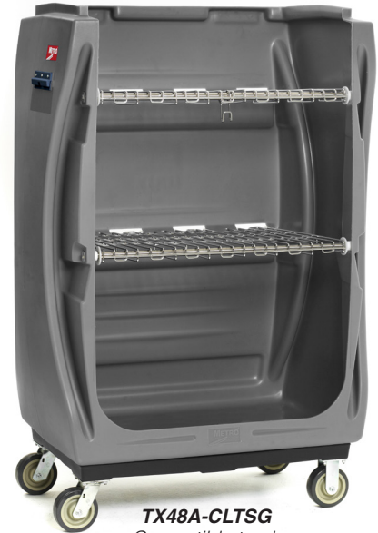
TX48A-CLTSG Convertible truck