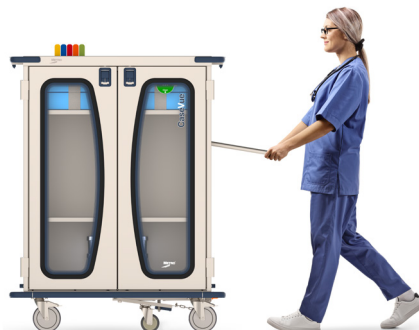
Handle swings up to ideal height.