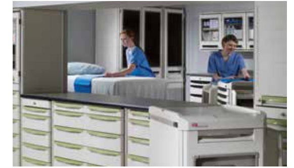
Starsys® Modular System for the O.R.