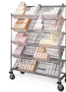
Super Erecta® Suture Cart

Human Engineered Shelving, Carts and Workcenters for the O.R.