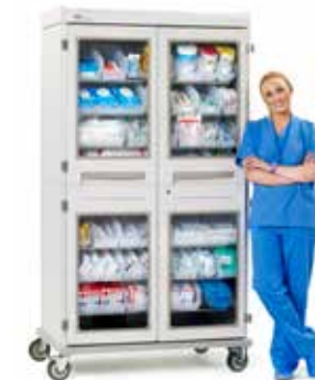
Starsys® XD O.R. Supply