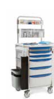
Flexline® Anesthesia Cart