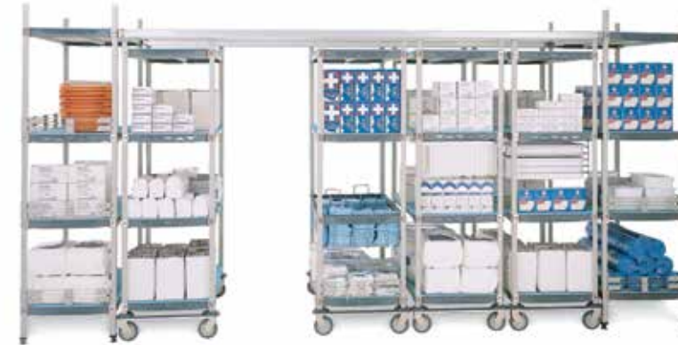
MetroMax i® Top Track® Storage System with Microban® Protection